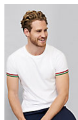
SOL'S RAINBOW MEN 03108